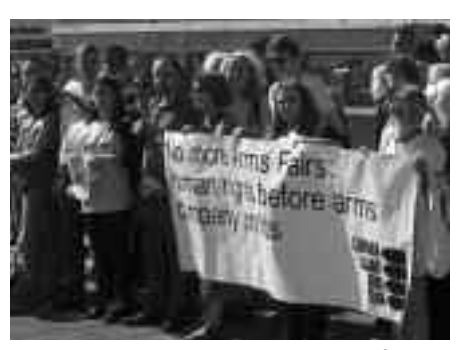
CAAT supporters at a previous arms fair

The Government says it intends a "much more rigorous approach" to promoting arms sales than the previous – already zealous – administration. In practice this means more UK arms turned on civilians around the world and more weapons