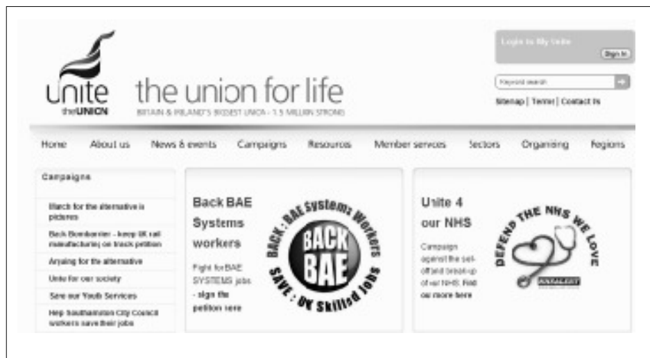
Mixed messages?

However, as the President of General Dynamics UK told the Commons Defence Committee in September 2010, "The skills that might be divested of a reducing defence industry do not just sit there waiting to come back. They will be mopped up by other industries that