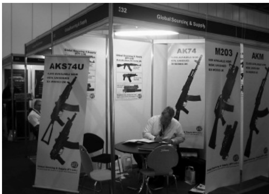
An exhibitor at the DSEi arms fair in London's Docklands