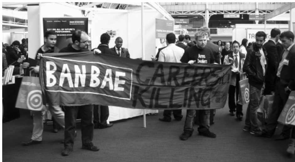
Campaigners take action in London

Students campaigned hard to kick arms companies off campus last term and organised some great actions. There were protests in Lancaster, Edinburgh, Leicester, Warwick, Bristol, Sheffield and London.