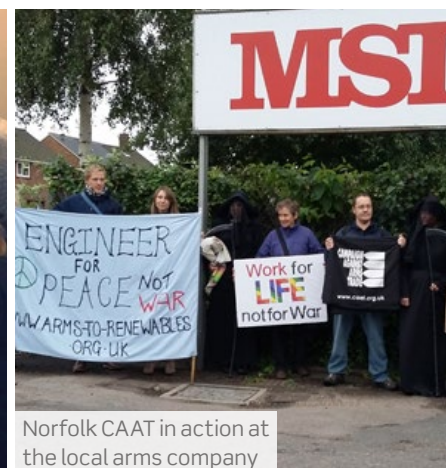
Norfolk CAAT in action at the local arms company