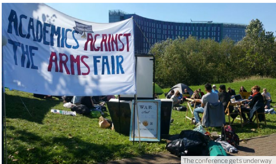
The conference gets underway

With moving interpretations of militarism presented out in the open air, and with all involved acutely aware of the arms fair close by, a unique environment for sharing ideas and building relationships emerged. Without