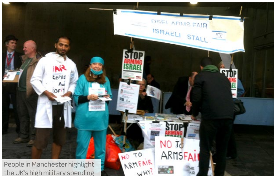
People in Manchester highlight the UK's high military spending

the lead exhibitor of the naval zone at DSEI. Liverpool activists have also been active in international solidarity work, launching a #StopArmsToSaudi campaign at Liverpool Pride and highlighting UK arms sales to Turkey.