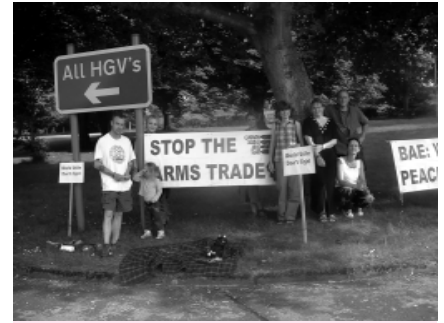
Outside BAE's explosives branch at Bridgwater (above) and the Westland factory in Yeovil (below)

Once again, an excellent public meeting was held in Bournemouth. ■