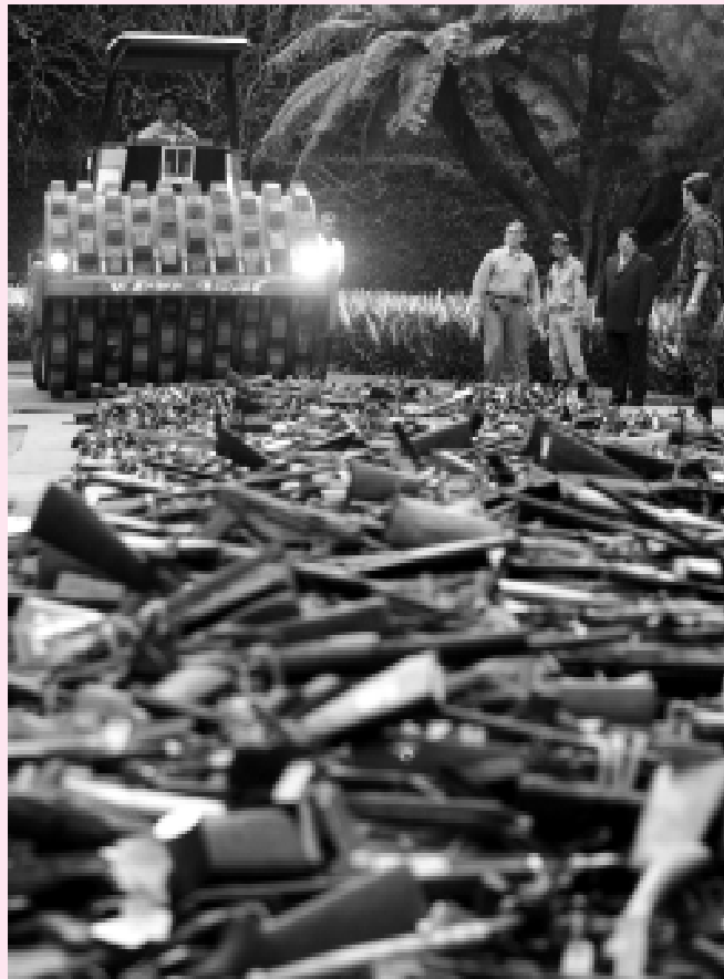
Crushing illegal arms by heavy construction equipment in Rio de Janeiro last year

www.un.org/News/briefings/docs/2003/IANSAconference.doc.htm