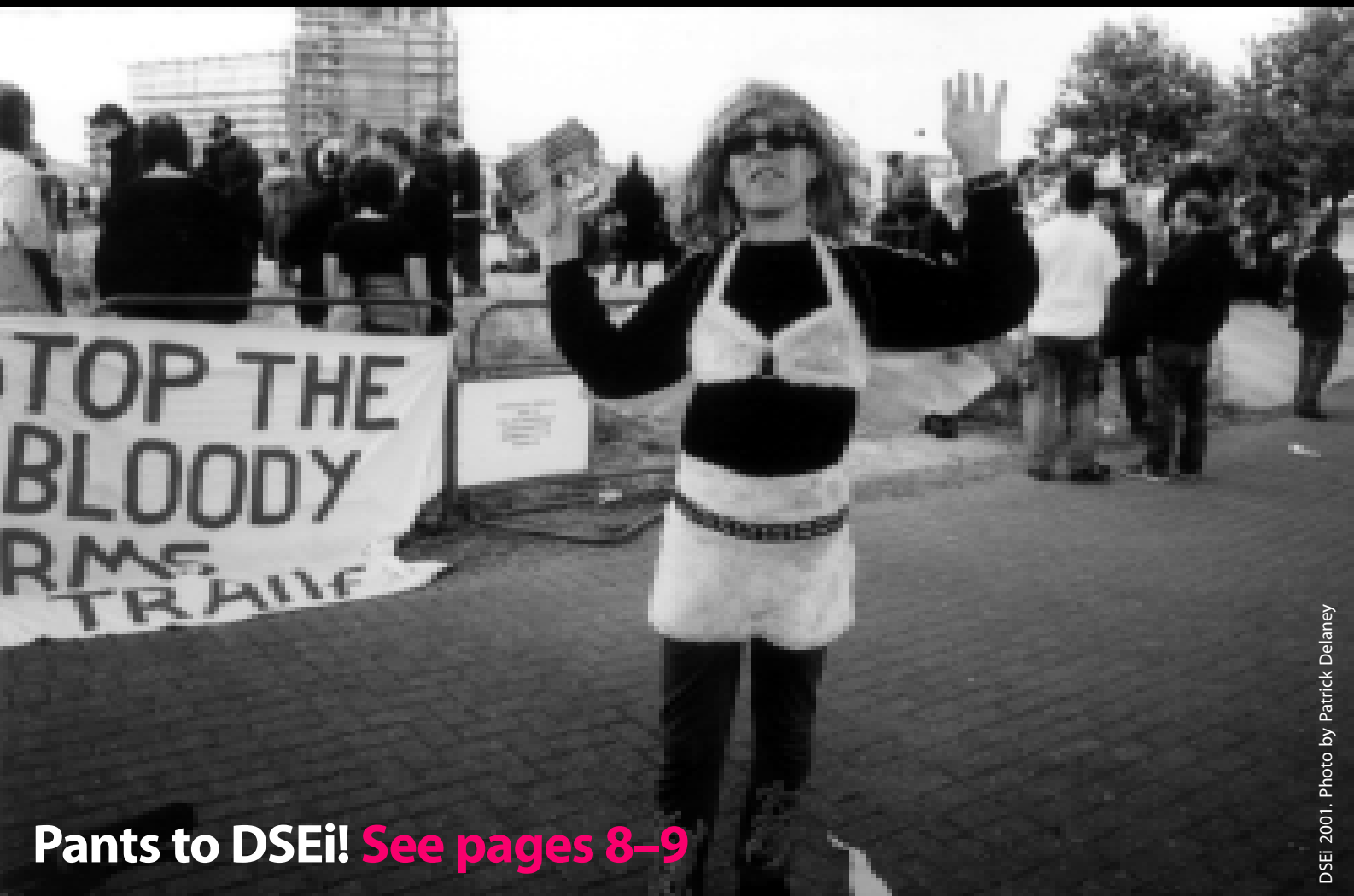
DSEi 2001. Photo by Patrick Delaney

11 Goodwin Street, London N4 3HQ tel 020-7281 0297 fax 020-7281 4369 email enquiries@caat.demon.co.uk web www.caat.org.uk