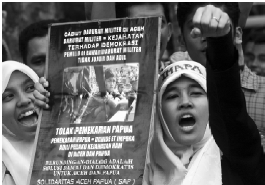
A peaceful rally in protest against the imposition of martial law in Aceh

applications for export licences against the Consolidated EU and National Arms Export Licensing Criteria. These clearly state that export licences should not be issued if "there is a clear risk that the proposed export might be used for internal repression". It would seem that the continued licensing of military exports bound for Indonesia is absolutely contrary to this. The only explanation would