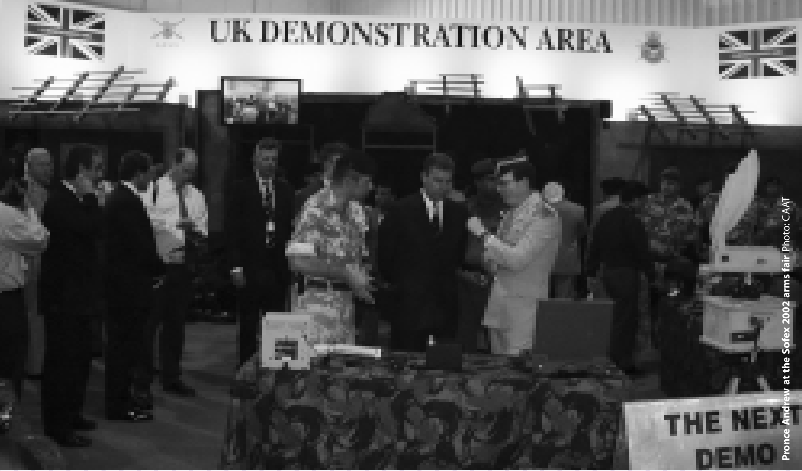
Pronce Andrew at the Sofex 2002 arms fair.