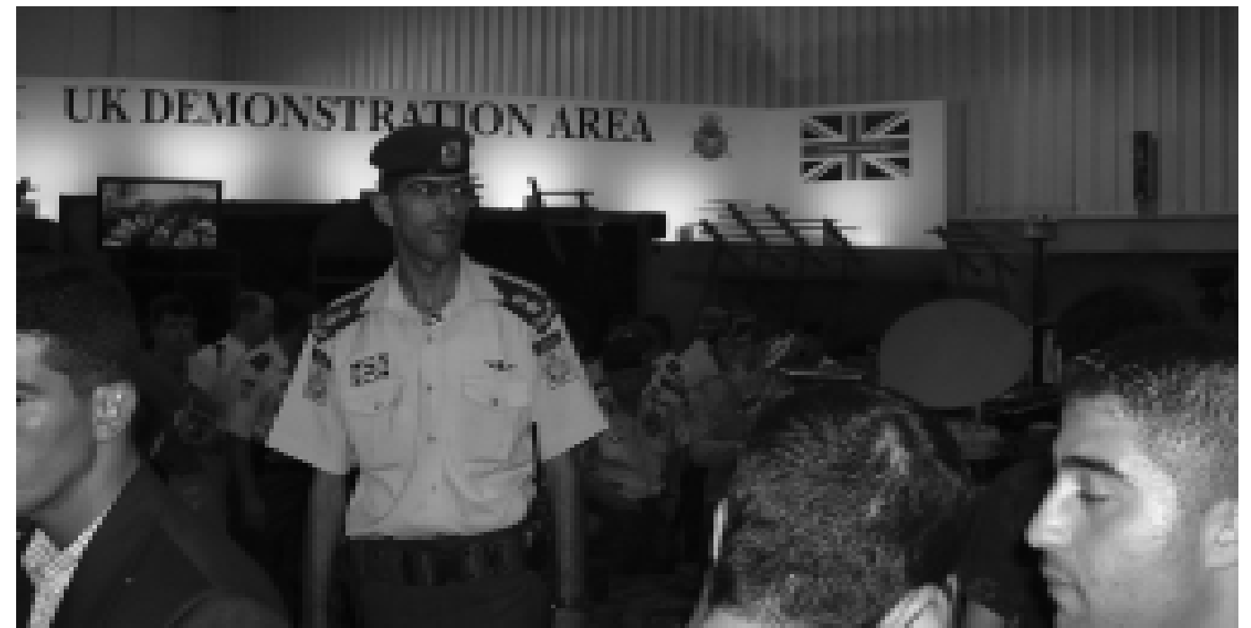
UK MoD-sponsored demo at an arms bazaar in Amman, Jordan, 2002

But BAE's goodwill has gone much further. Such is their generosity that BAE has consistently helped out those working at the MoD by offering them jobs, sometimes even lending the MoD