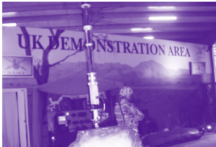
Abu Dhabi 2003 arms fair

CAAT News is part of INK, the Independent News Collective. www.ink.uk.com