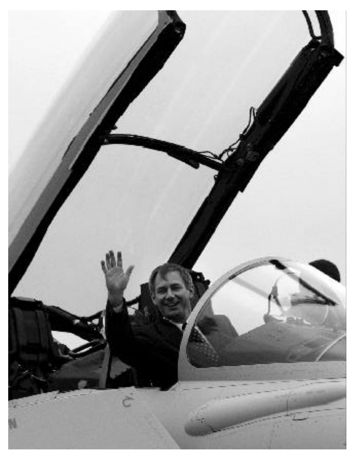
Defence Secretary Geoff Hoon enjoying the first UK production Eurofighter at Farnborough 2002