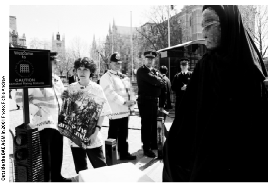
BAE Systems AGM - see page 8