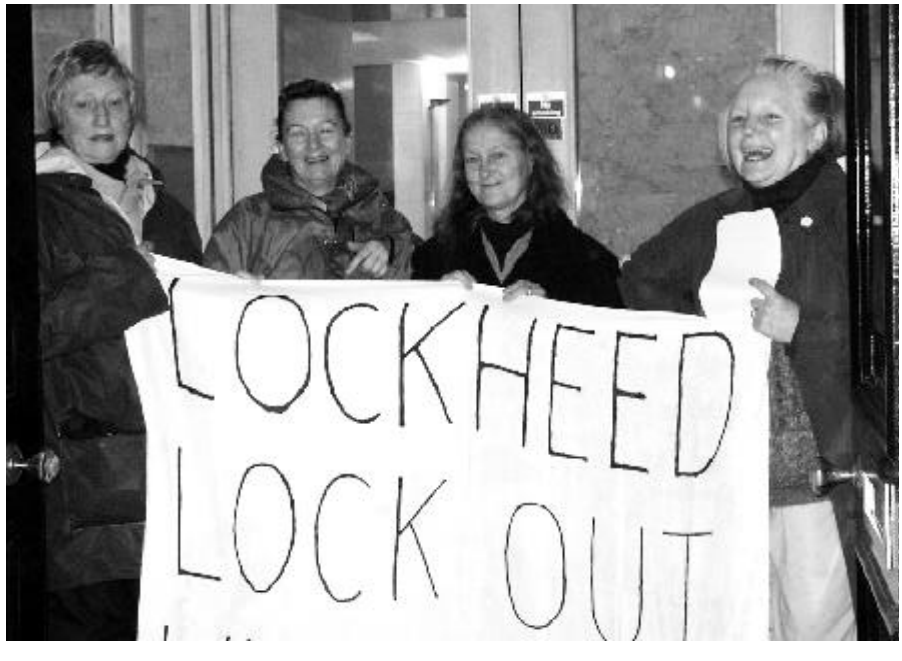
Trident Ploughshare activists outside Lockheed Martin's London office near Victoria

Other Trident Ploughshares activists handed out leaflets to passers by which