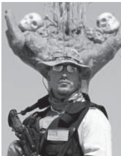
A ‘private security guard’ at a mass grave site in Iraq

Spicer, on the other hand has moved on and up. Mercenaries have become big business, with an estimated turnover worldwide of $100bn, and he has just landed a substantial slice of it. Earlier this year his new company, Aegis Defence Services, was awarded a $293m contract by the Pentagon to “co-ordinate” the 50-odd security companies now operating in Iraq. Rival US companies are outraged, as is the Irish lobby, for whom Spicer’s role as a battalion commander in Northern Ireland made him a bogey figure, and it is