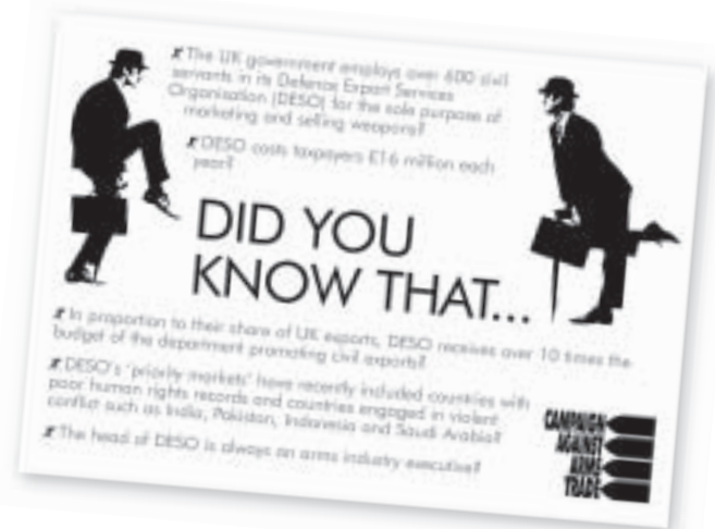
The postcard handed out to passers-by