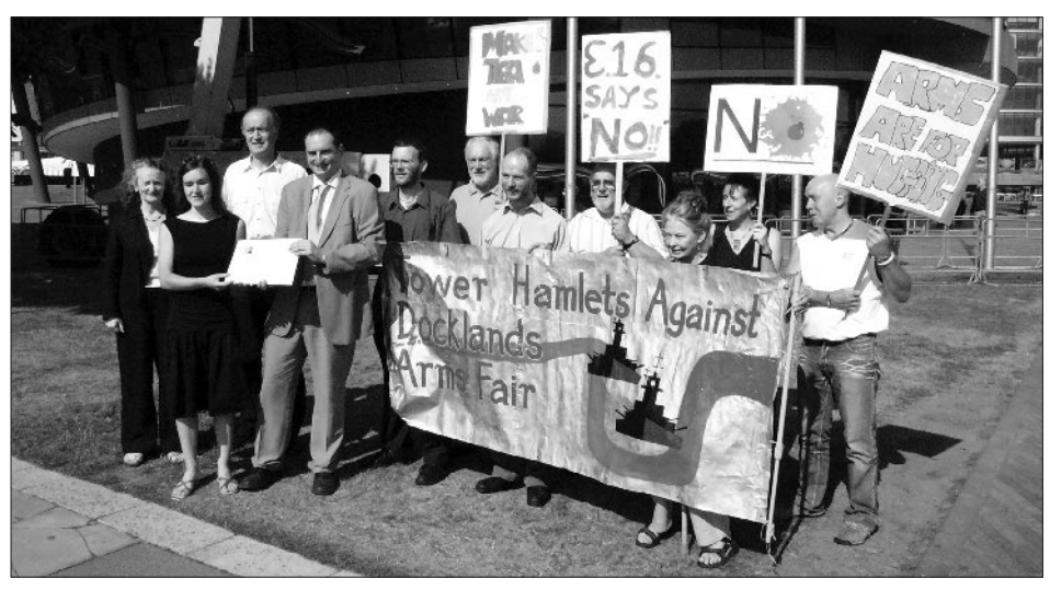
Campaigners hand in a petition of over 1,000 signatures to the London Assembly, calling for DSEi to be cancelled {\mbox{\tiny CAAT}}

CAAT alternative DSEi conference, part I: Sunday 11th September will see a day of talks, workshops, training, films and networking at Toynbee Hall, 28 Commercial Street, London E1 (nearest tube is Aldgate East). It will be a great opportunity to