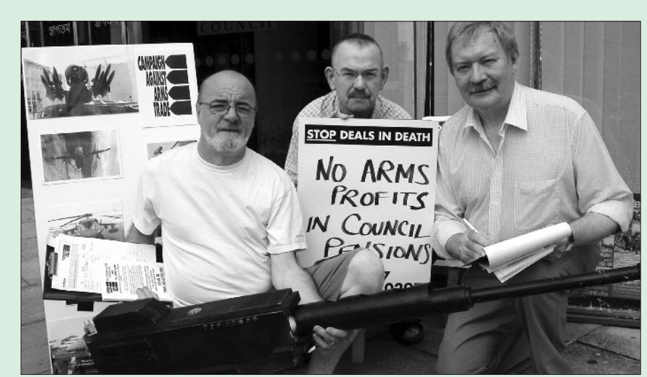
Leader of the Liberal Democrat group (on right) on Rochdale Council, signs Manchester CAAT's petition

A Freedom of Information request revealed that the Fund had investments in four UK arms companies, one Japanese arms company and four US arms companies. It had its largest number of shares in Singapore Technologies Engineering, which has products including the world's lightest machine gun. So there is much to protest about!!