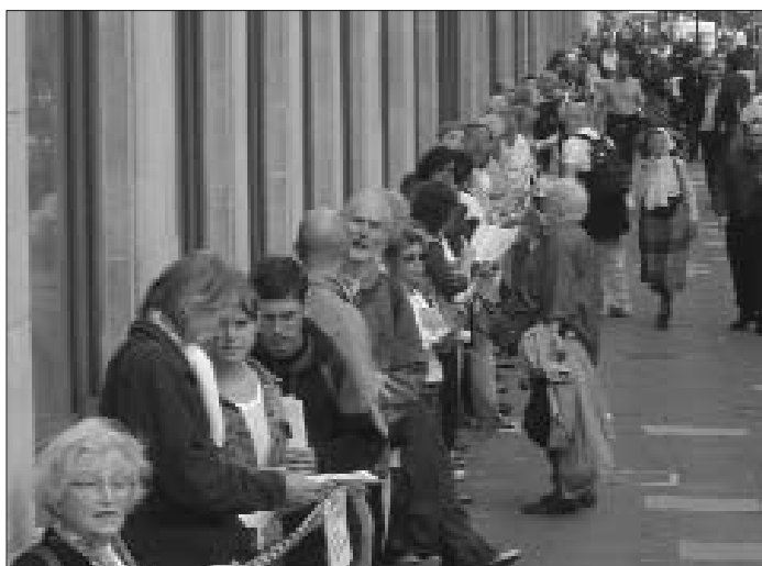
Supporters from CAAT, Fellowship of Reconciliation, Pax Christi, and SPEAK took part