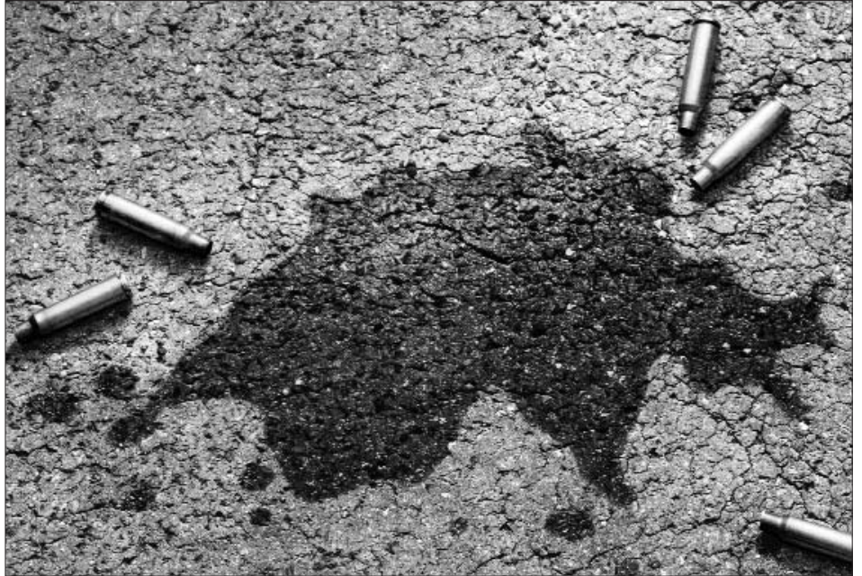
A blood spot in the shape of Switzerland symbolizes the deadly effect of Swiss arms exports WWW.KRIEGSMATERIAL.CH

Similar to the UK, Swiss legal framework and conventions oblige the agency responsible for the granting of export licences, the State Secretariat for Economic Affairs, to consider issues like UN embargoes and the situation or behaviour of the recipient country. However, this did not prevent Switzerland granting or exporting arms in recent years to countries including Pakistan, India, South Korea, Iraq, Morocco, Egypt, Saudi Arabia, Turkey, the United Arab Emirates and the US. When Swiss campaigners opposed the delivery of components for the US aircraft F/A-18 during the invasion of Iraq, the Swiss government responded with the ludicrous argument that the parts would not be used in the ongoing US campaign. As the regulations prohibit any deliveries to countries that violate international law, this example illustrates how the Government is