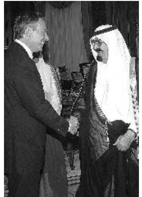
Saudi King Abdullah welcomes former British Prime Minister Tony Blair in Jeddah, September 2007

BAE will be hoping that King Abdullah is reassured of UK friendship during his visit. Conversely, CAAT is expecting widespread support for a demonstration on 30 October to coincide with Abdullah's arrival in the UK. The demonstration, which will be both lawful and nonviolent, will call for the reopening of the SFO inquiry and for an end to the Government's subservience to BAE and the Saudi regime.