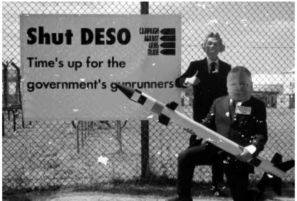
DESO protest at Farnborough 2006. See pages 8–9 CAAT