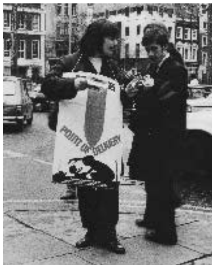
Protest outside the (then) DSO office in 1980

DESO, originally known as the Defence Sales Organisation, was established by Labour Defence Secretary Denis Healey in 1966. CAAT was set up in 1974 and almost immediately started campaigning to shut DESO. Over the years there have been vigils outside its offices, signatures collected on petitions, media photo opportunities, Early Day Motions (a kind of parliamentary petition) – all calling for the closure of the Government's arms sales unit. So why now? What worked in 2007 that didn't in 1977, 1987 or 1997? That is a question being asked in the office and we would like to hear from you if you have ideas about it.