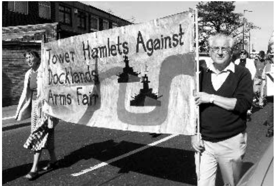
This year’s protests against the DSEi arms fair