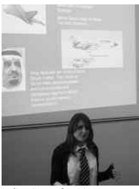
Delivering a damning account of BAE's record to staff and students

On 31st October, a group of Lancaster University students entered the Great Hall on campus in order to protest BAE Systems' presence at their careers fair. Two students gave out leaflets in the foyer. A further four students entered the hall and stood in front of BAE's stall with a banner reading 'Get a career in killing with BAE Systems'. They handed out leaflets and talked to students around the stall. The group then moved to one of the busiest parts of campus to hold a 'die-in' around a banner reading 'BAE Systems: a job to die for'. Many people stopped to ask about BAE and the protest. Two