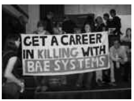
Inside the careers fair

Shortly after noon on 30th October, a group of activists entered the Yorkshire Autumn Graduate