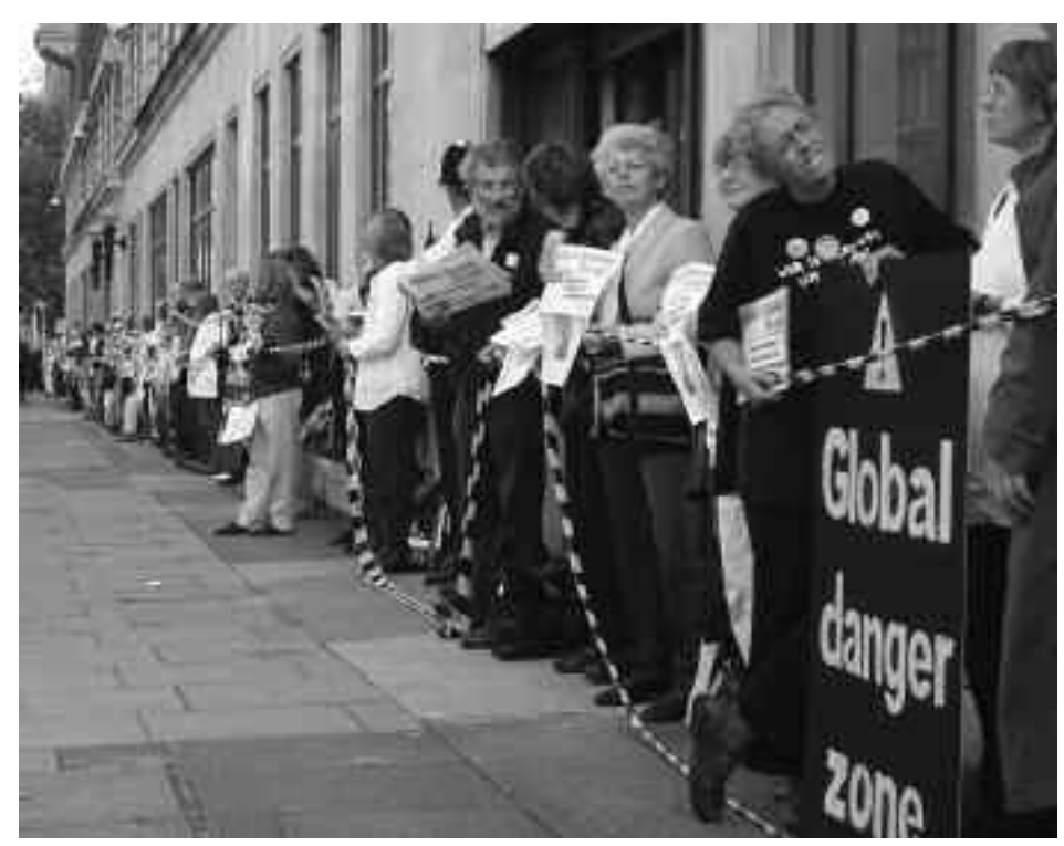
Over 250 people encircled DESO's offices as part of CAAT's Shut DESO action day, October 2006 CAAT

Whilst the Government will still be promoting arms exports, the industry's privileged position is, at the very least, weakened. The provisionally-named UKTI Defence and Security Group (DSG) will take over responsibility for the promotion of military exports on 1st April. Initially it will have 240 staff. This is far more than any of the other industry sector groups. CAAT was expecting this as it is, apparently, quite usual for whole groups to be