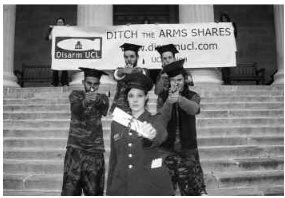
UCL students graduate from the university of war. See page 6