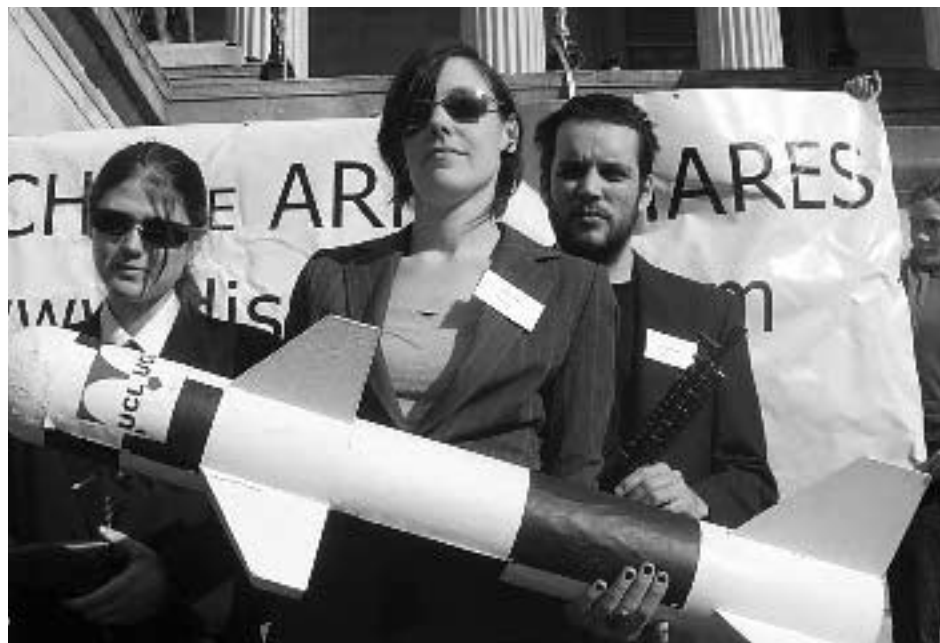
UCL students take action over arms investments – see page 10