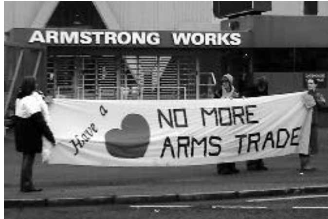
Newcastle CAAT group protests at local BAE site on Valentine's Day

Wherever you live, this is a great opportunity to take coordinated local action against the arms trade. CAAT can provide Control BAE postcards and petitions to use and distribute locally, and we may be able to put you in touch with others in your area. Can you organise a campaign day, public meeting or protest that week? Or run a stall in your town centre, library or other public place? Perhaps you could get people in your area to write letters or take online action. If you are organising an event or action, invite your local MP(s) along and tell the local media your plans. Be imaginative – whatever action you can take will help.