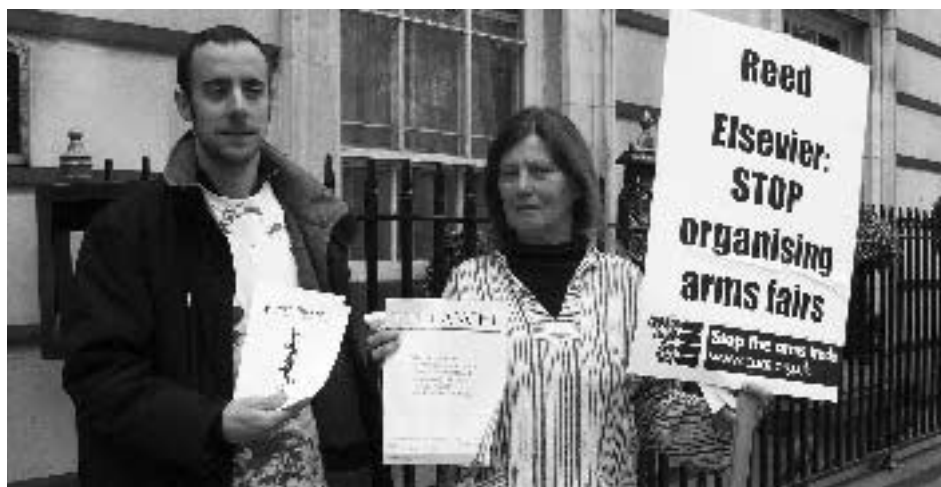
Outside the Reed Elsevier AGM in 2007

DSEi-organiser Reed Elsevier has missed its deadline for exiting the arms fairs business. Last June, following a two-year campaign co-ordinated by, the company announced: 'Reed Elsevier intends to complete its withdrawal during the second half of 2007, subject to honouring its obligations to partners, customers and other key stakeholders.' However, just a few weeks ago, the Guardian reported