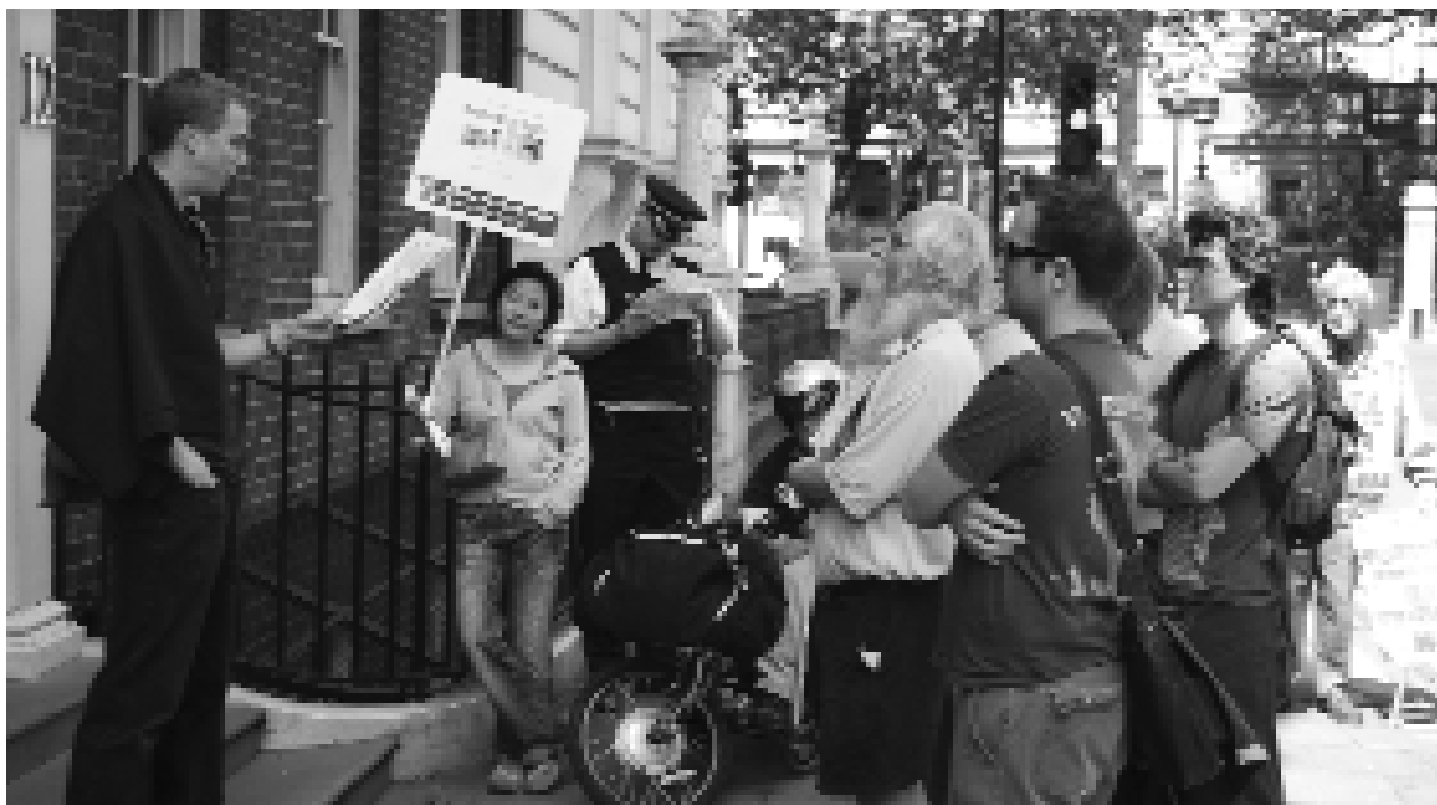
London CAAT visit the 'Merchants of Death' CAAT

sign it, and no-one refuses after reading it. There is a lot of anger about the Government's stance."