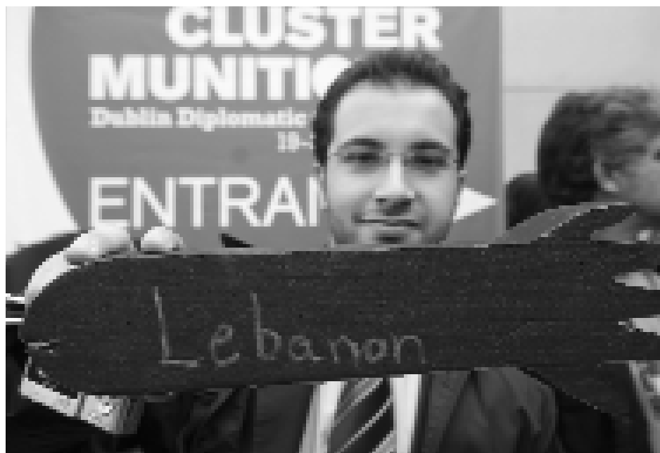
Cluster bombs treaty agreed. See page 10 ANZ CLUSTER MUNITION COALITION