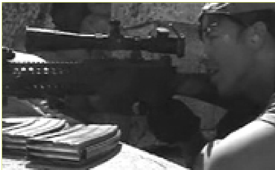
Video still of a Blackwater sniper 'at work' in Najaf WAR ON WANT

INDEPENDENT, 28/6/08; DAILY TELEGRAPH, 28/6/08 AND 29/5/08