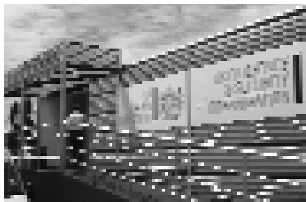
Farnborough arms fair CAAT

The House of Commons' Justice Committee has already criticised the Bill, arguing that it does not provide for a clear split in the role of Attorney General. It advocates the creation of a non-political legal adviser whilst the policy decisions are undertaken by a Justice Minister.