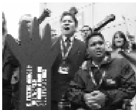
Cluster bomb survivors in Dublin ANZ CLUSTER MUNITION COALITION

Delivering the Cluster Munition Convention was a momentous and historic step, but the work of governments and individuals around the world is really just beginning. To become binding in international law, 30 governments must ratify the treaty after it is signed in Oslo in December 2008. The UK government has confirmed that it will be among the countries that sign the treaty in December. Now the UK must implement national legislation to