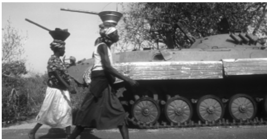
Angola is littered with the instruments of war

My church is involved in community development projects in rural areas around Mavinga in Cuando Cubango province in southern Angola. Our projects include literacy classes, midwifery, community