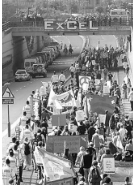
A previous DSEi protest

Over 26,000 visitors are expected in 2009. Buyers come from all over the world and more than a third of the world's governments are likely to be represented. Many of these will be