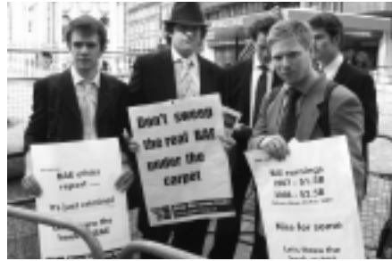
Campaigners tell it like it is

"Probably four or five – I don't know." Cue incredulous laughter.