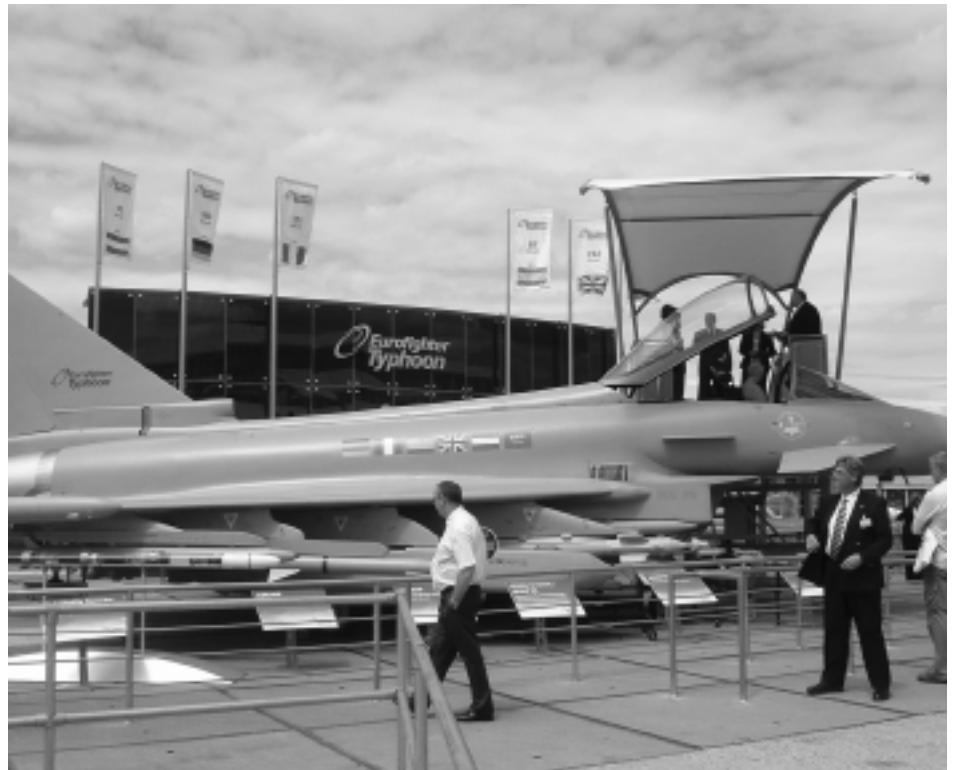
BAE's Eurofighter on display at Farnborough Air Show 2008

In February, the Information Commissioner ruled that the ECGD should give CAAT part of the ECGD's Underwriting Committee's assessment of the Al Yamamah deal. In yet another attempt to keep the saga secret, the Government has appealed to the Information Tribunal. The hearing, in which CAAT is an Additional Party, takes place in mid-September.