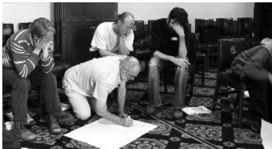
Supporters at the last local campaigners gathering get stuck into a workshop