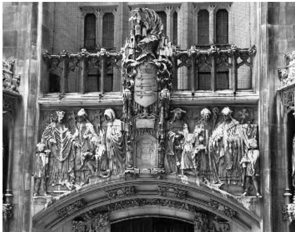
The High Court in London, scene of the 2008 judicial review judgement

Some media articles have suggested that the SFO is likely to be selective over the cases to be taken forward, maybe concentrating on the easier ones. These reports are worrying, since they might suggest