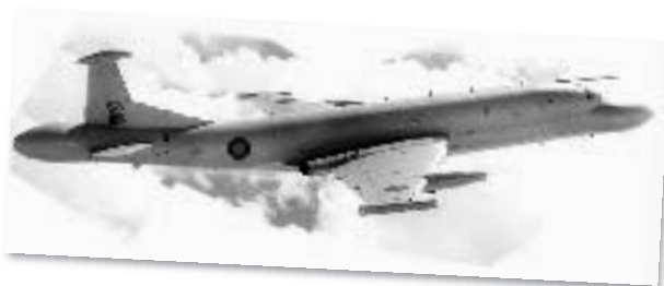
A BAE Nimrod, described by the review as having "serious design flaws"