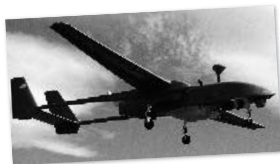
An Israeli UAV in flight