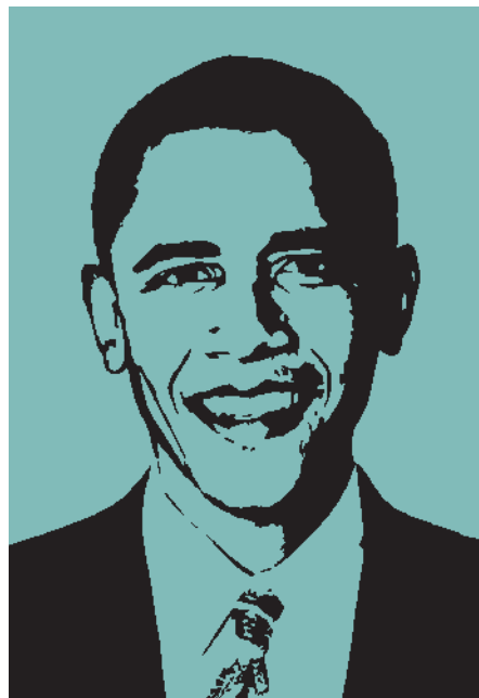
President Barack Obama – steps and missteps on weapons exports

In other words, a potential arms sale should be judged in part on whether it is good for weapons manufacturers. The Bush administration did not formally change this policy and used the global war on terror to fast-track