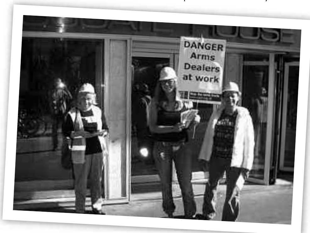
London CAAT dressed as demolition workers outside the government's arms sales department – see box on right