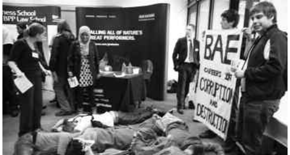
A "die-in" at a recruitment stall brings home the impact of the arms industry

Counter-recruitment campaigns can be hugely successful. For example, the energy giant E.ON abandoned its recruitment tour in 2008 following constant opposition