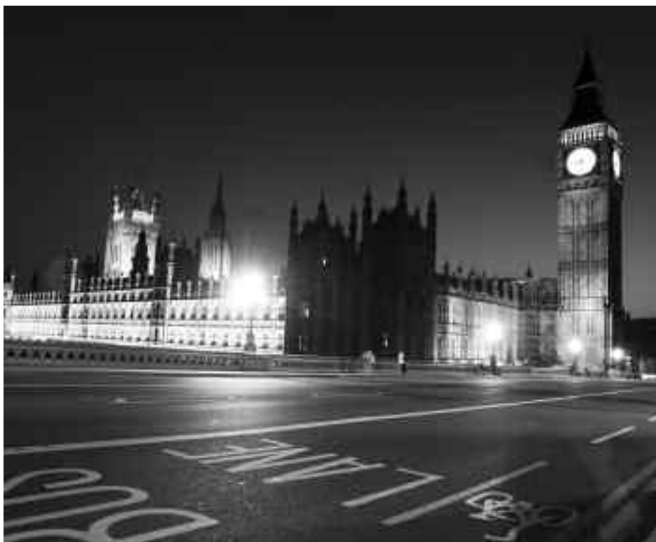
A change of Government – will there be a policy change on arms sales?

As the Business Secretary, Vince Cable is now responsible for the arms export promotion unit, UK Trade & Investment's Defence & Security Organisation, as well as the ECGD. He is also in charge of export licensing. So does having a leading Government minister