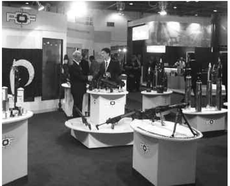
The Pakistan Ordnance Factories display at DSEi 2009; Pakistan and India have fought three wars over Kashmir

This February India's Defence Minister A.K. Antony said that the country's defence policy "is not against any one country" but admitted at the same time that it was