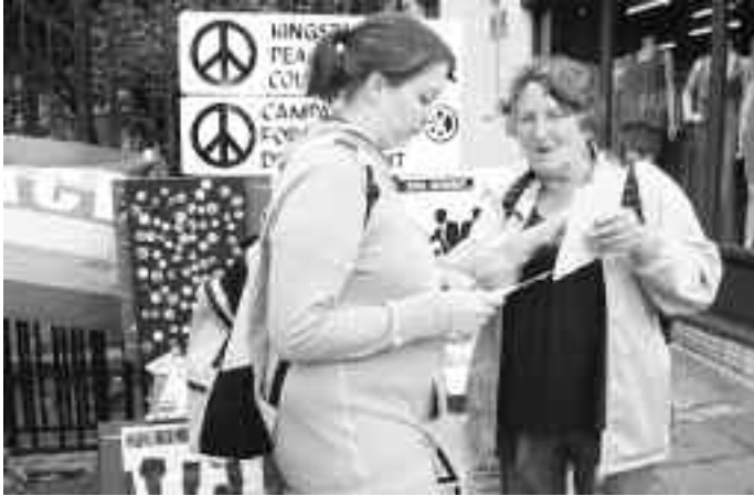
Kingston Peace Council engage people at their stall in Stop Week