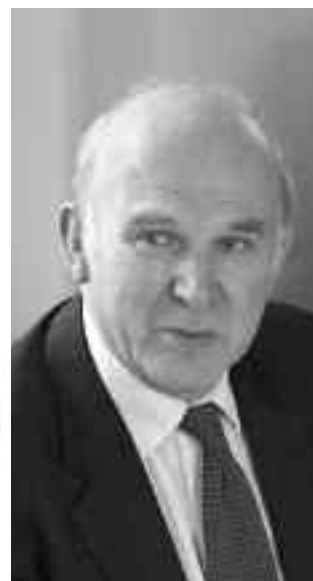
L-R: Nick Harvey, Peter Luff and Vince Cable

about arms exports and to promise the support of senior ministers for them.