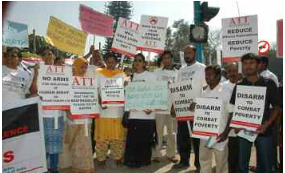
Supporters of Control Arms Foundation of India (CAFI) demonstrate at the AeroIndia arms fair in 2009.

In September, just six weeks after the fanfare around the Hawk deal, BAE announced that it was shedding one thousand jobs in five plants. One of the hardest hit was Brough with over 200 jobs to go. BAE justified the cuts stating that: "The job losses result from the impact of the changes in the defence programme announced in December 2009, together with other workload changes."