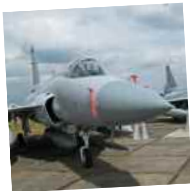
JF-17 fighter aircraft

In July, CAAT's Ian Prichard attended Farnborough 2010: an arms fair masquerading as an air show - and supported by the government's arms trading unit, UKTI DSO.