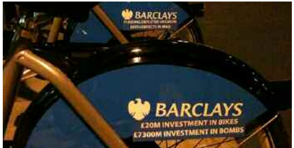
Some of the stickers featuring messages about Barclays

On the eve of the launch of the Barclays-sponsored pay-as-you-go bike scheme in London, activists covered the bikes with stickers that highlighted the banking giant's involvement in the global arms trade.