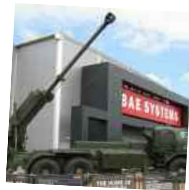
BAE Archer howitzer

In prime position in Hall 1 was a large UKTI DSO stand. The organisation also had its own private chalet purely for its arms promotion