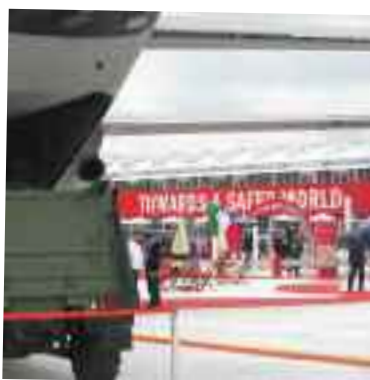
Unfortunately, we don't think this sign was meant to be ironic...

Near the JF-17s was the base for "Futures Day", a "new and exciting programme" for 7-21 year olds aimed at "Inspiring Young Minds