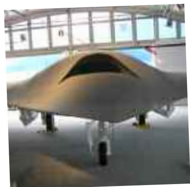
Boeing Phantom Ray drone

Lots of drones were present, as well as the odd robot. Boeing had a building full of them, there was a specific drone pavillion and individual companies displayed them in their exhibition space including BAE, Israel Aerospace Industries, Northrop Grumman, Finmeccanica, Thales and QinetiQ and General Atomics, the makers of the CIA's preferred assassination-drones in Pakistan.