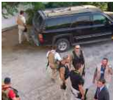
Mercenaries on a US State Department detail in Baghdad