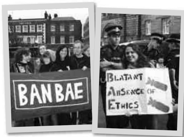
Campaign launch actions took place at 13 universities around the UK

The Guardian newspaper has been instrumental in exposing the shady activities of BAE Systems, so we were surprised to hear that BAE would be appearing at a Guardian -sponsored Graduate Fair. The news spurred Ban BAE supporters into action and a protest took place at the event, disrupting both the BAE stall and the company's presentation. We are now in the process of petitioning the Guardian and The Careers Group to exclude BAE Systems from future events. Our argument is that it is unacceptable for the careers service of an institution of learning, and for a newspaper that prides itself on its