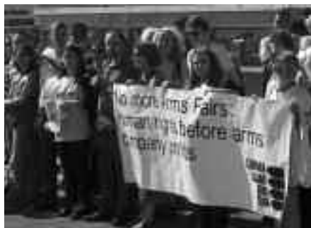
CAAT supporters at a previous arms fair

The Government says it intends a "much more rigorous approach" to promoting arms sales than the previous – already zealous – administration. In practice this means more UK arms turned on civilians around the world and more weapons