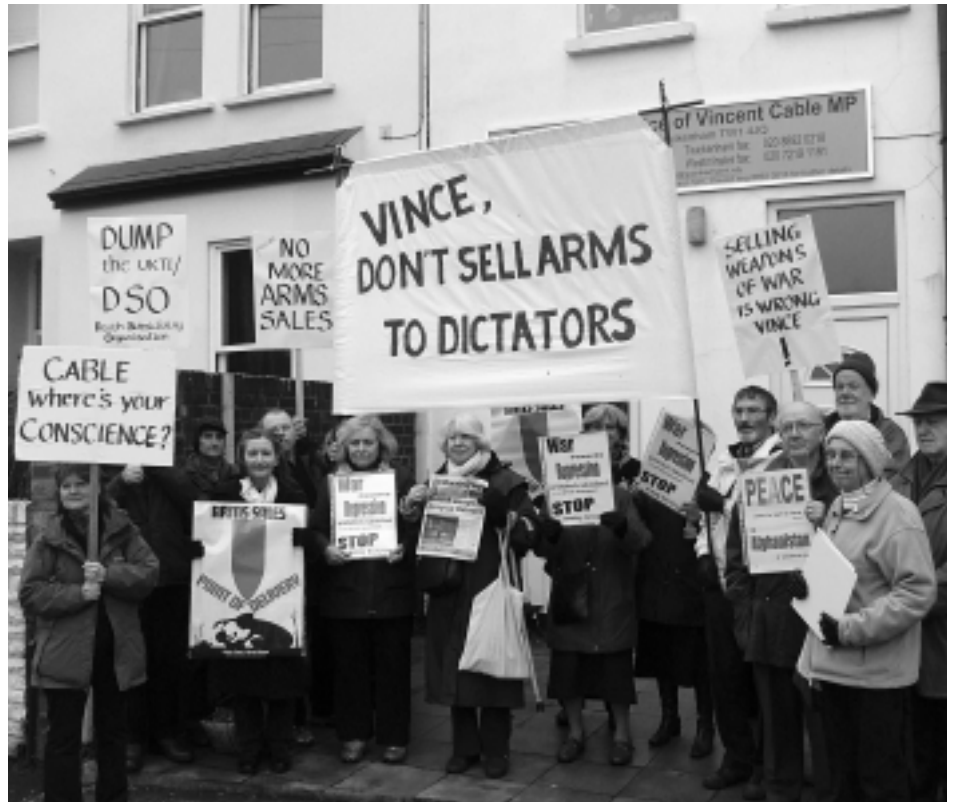
Business Minister Vince Cable gets lobbied over UK arms sales to Libya