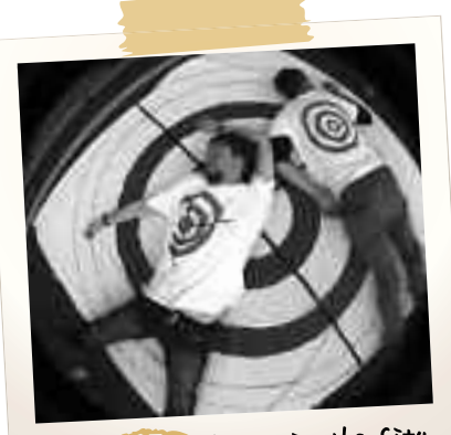
Action against drones in the City

Above: the 'die-in' outside the National Gallery