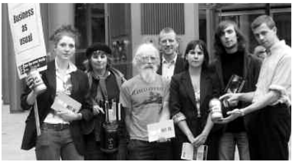
CAAT's protest outside the Government's Middle Eastern arms sales event caused the meeting to be moved and created rather more publicity for the event than the organisers wished for.

Unfortunately, CAAT had also seen documents suggesting invites had been issued to at least 61 countries and we had our suspicions about the identities of the unacknowledged 24. That DSEi would be "business as usual' became painfully clear with a pre-DSEi seminar focusing on the Middle East as "a vast market for UK defence and security companies". Senior civil servants from the Government's arms promotion unit were there to advise arms companies how to sell to this "priority market." Bahrain – where violent repression continues – was listed as a "top destination" for companies wishing to increase their "business potential."