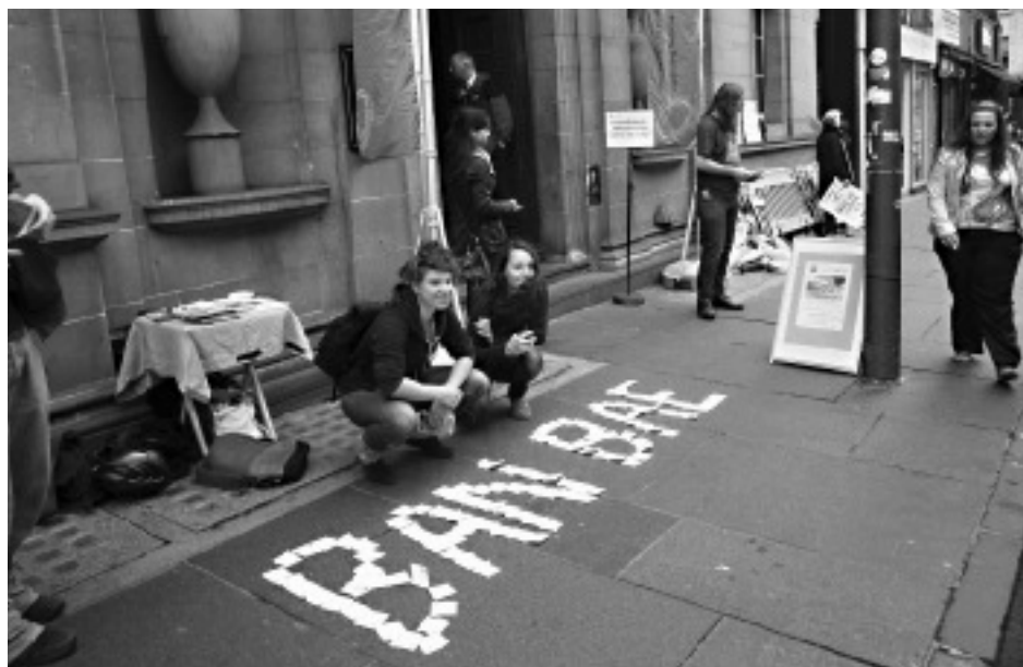
Edinburgh students tell it with post-its – see page 6 for story.