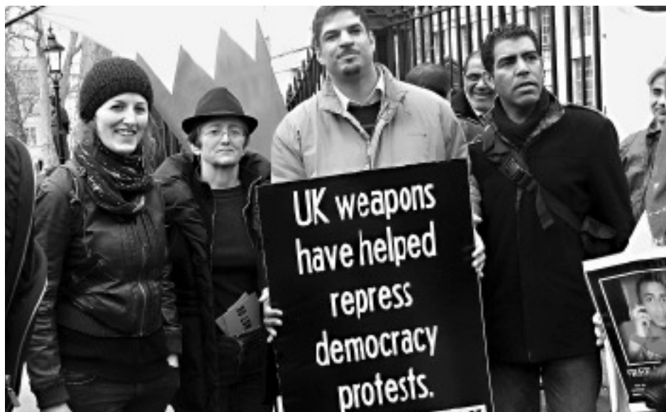
CAAT supporters join Bahrain democracy activists outside Downing Street on 14 February 2012. The man in the centre was injured in a protest and his sight is now permanently impaired.

Yet the UK continued to licence huge amounts of arms for export to Saudi Arabia. In 2011, "military exports" totalled £1.735 billion with "aircraft, helicopters, drones" valued at £1.708 billion.