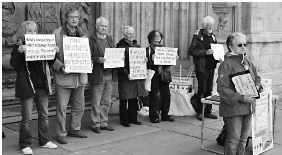
Protest outside Bath Abbey against Clarion Events' drone conference