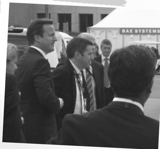
David Cameron was there to help the arms sales effort.