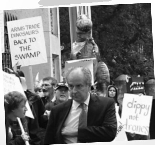
Protesters were also there to greet arms dealers as they arrived for the reception.