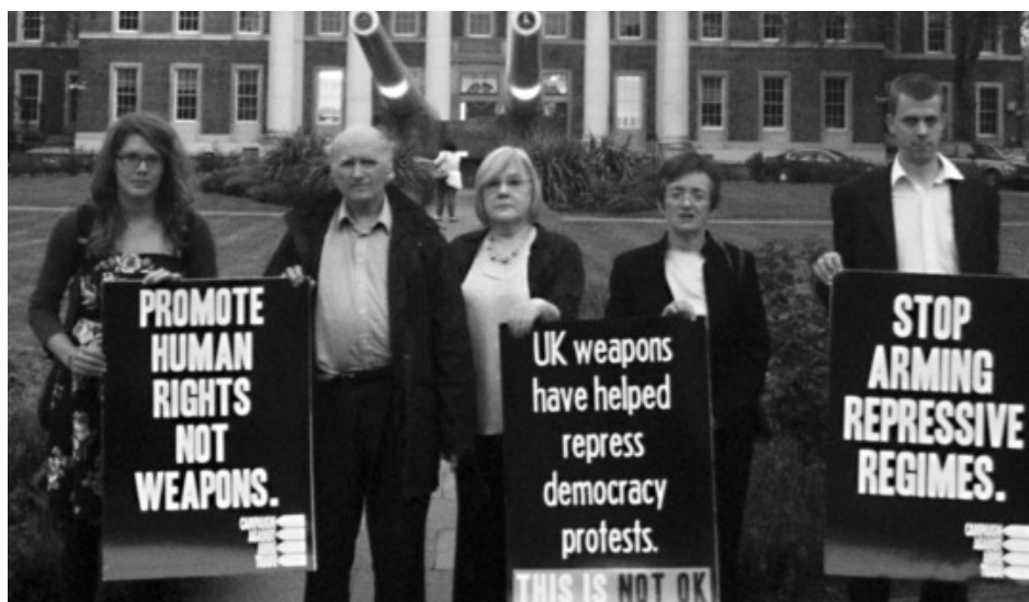
CAAT protest at the Imperial War Museum

Order a copy of the Local Campaigns Guide or find out more