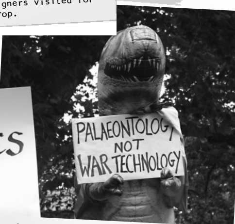
CAAT delivered a letter from eminent scientists condemning the decision to host the reception and urging that the museum sever all links with the arms trade.