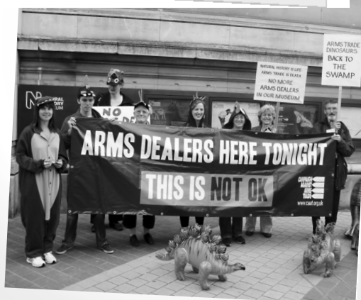
Campaigners were there on the day of the reception - with dinosaurs - to talk to Museum visitors and staff.