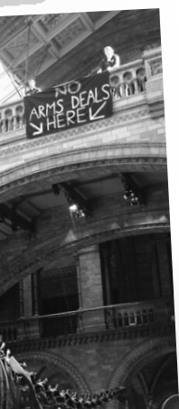
Protesters were due to enter the Museum's reception area for the reception.