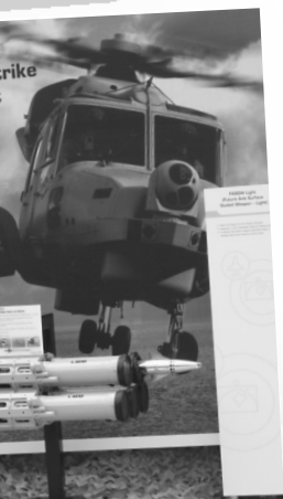
Combined arms fair and exhibition. Nine of the arms companies were taking part this year.