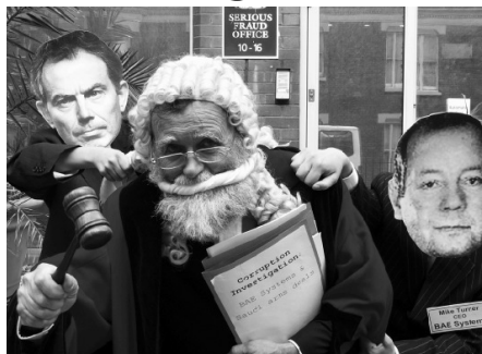
Gagging justice – CAAT outside the SFO offices in 2007