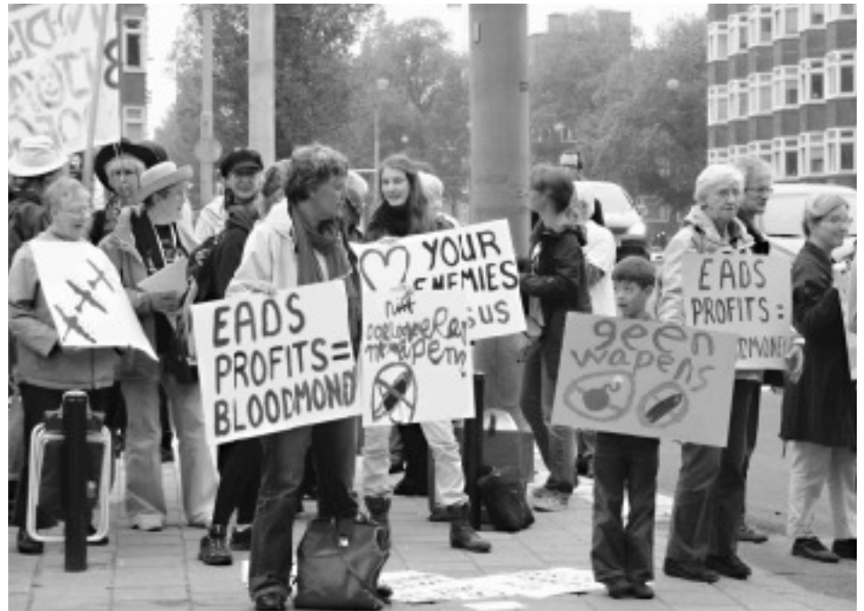
Campagne tegen Wapenhandel (Dutch Campaign Against Arms Trade) protest outside EADS AGM in Amsterdam.

On the positive side, BAE's self-generated image as an ultra-patriotic British company would be damaged by the merger. It would be much