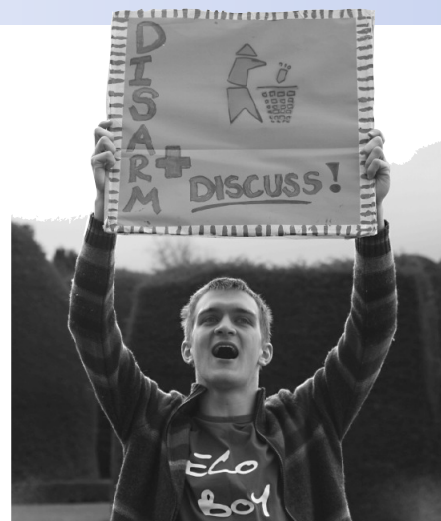
A student calls on his university to "disarm and discuss"

The gathering will be a day of workshops and discussions, relevant