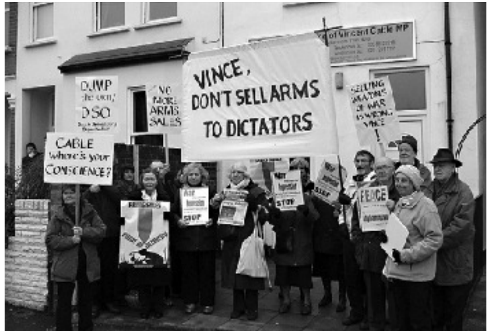
Constituents held Vince Cable to account with a vigil at his surgery

Some countries are still paying Vince Cable's department for debts that were run up through UK arms sales to their former dictators. We call for these, and other unjust debts, to be cancelled. We also want to see arms sales substantially restricted where they divert resources from