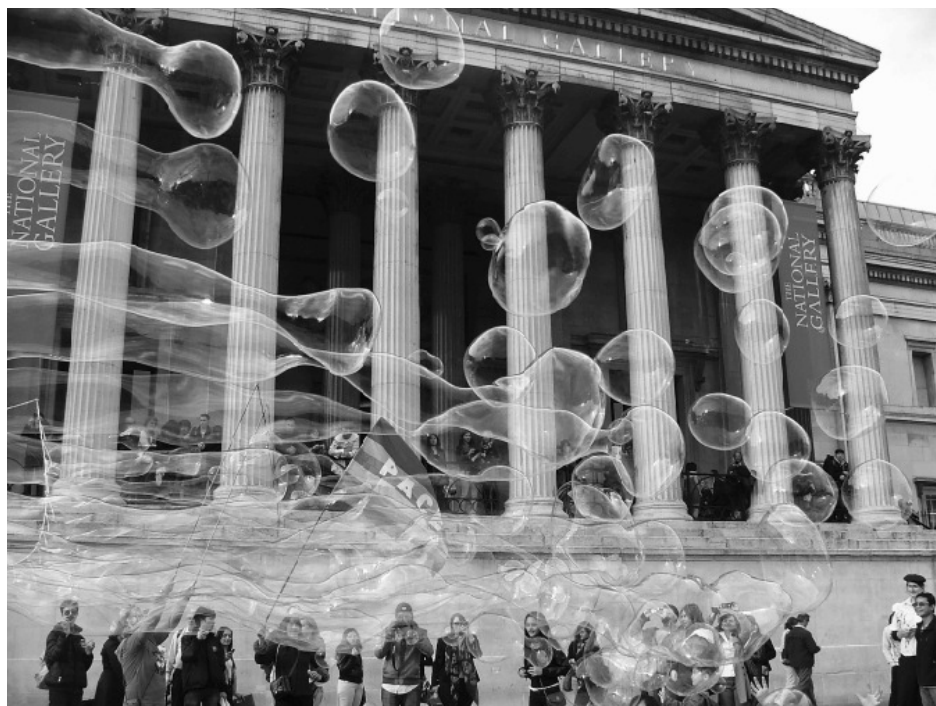
Bubbles not Bombs: on 21 September, the International Day of Peace, giant bubbles filled Trafalgar Square with the message "Bubbles Not Bombs" to highlight the National Gallery's support for the arms trade

which it says is "an opportunity to say thank you to customers and clients for their support throughout the year."