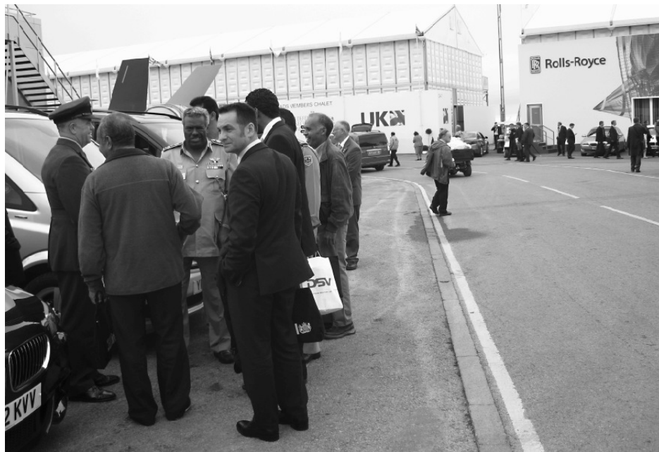
Despite considerable chaos at home, Libyan military personnel enjoyed their "priority market" status at the Farnborough Airshow, being snapped doing their rounds of the displays.

The Government's role in promoting military exports, including through the UK Trade & Investment Defence & Security Organisation (UKTI DSO) has also been considered by CAEC. In November 2011 arms industry representatives told CAEC that the markets envisaged for new military orders were in eastern Europe and the USA and "shouldn't really cause significant concern". CAAT wrote to