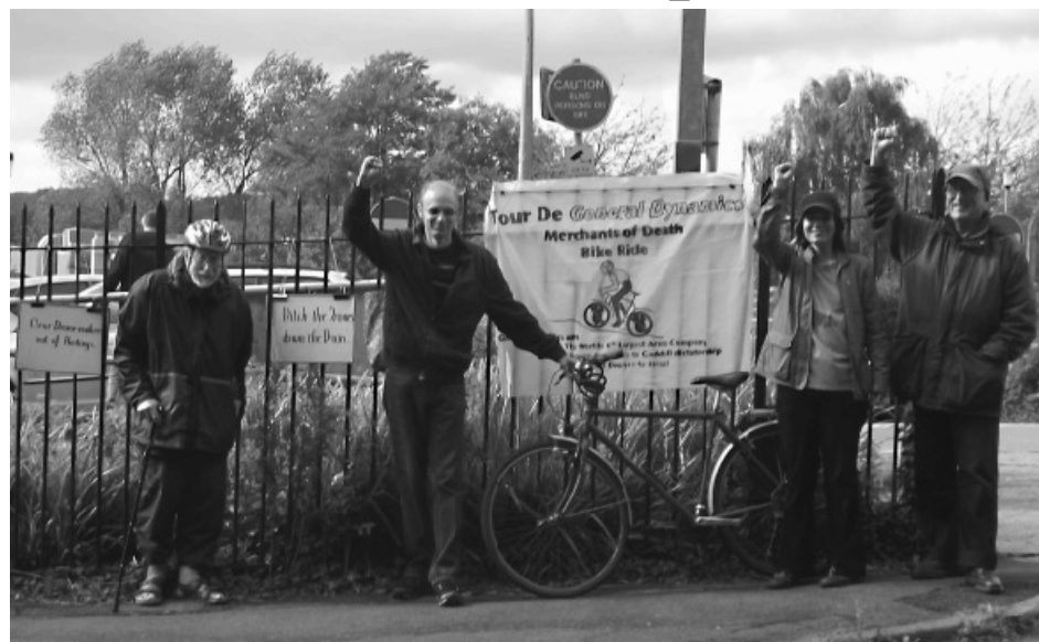
Hastings campaigners on the Merchants of Death Bike Ride

5 Nottingham: In Nottingham, the Shut Down Heckler & Koch campaign leafleted as people arrived at a conference at the church next door to the arms company.