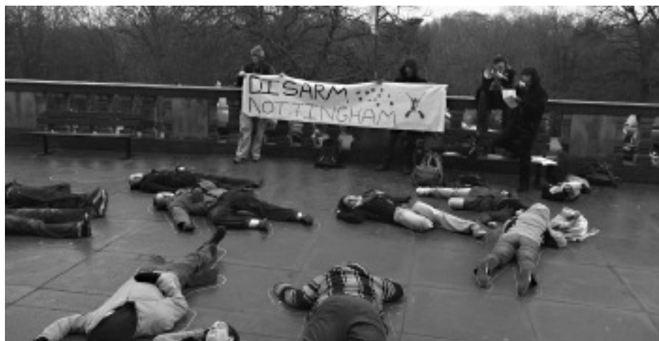
Nottingham students stage a die-in in 2009

Direct UK government military funding to the 16 universities totalled £23.6 million over the three years – 28 per cent of the total from UK military funding sources. The funding agencies were the Ministry of Defence, Atomic Weapons Establishment and Defence Science Technology Laboratory. The largest recipients were Imperial College with £7.8 million and Kings College with £5.4 million.