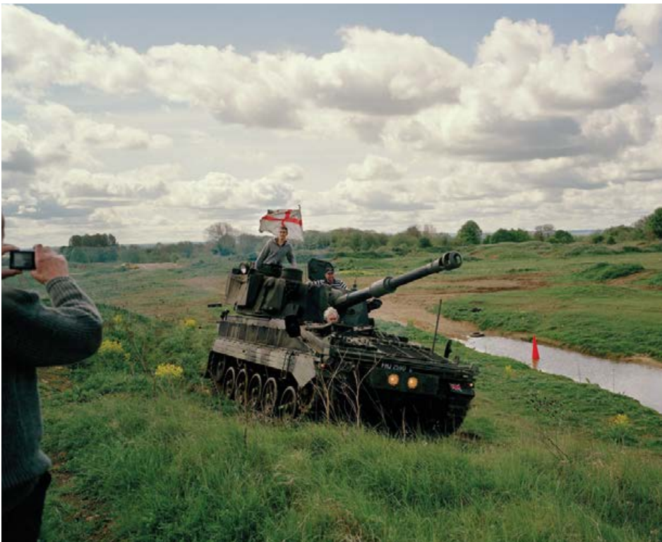
Tank rides at Abingdon Air and Country Show, Dalton Barracks, Oxfordshire, 3 May 2009.

Exhibiting at Durham DLI Museum and Art Gallery , 28 June – 21 September 2014.