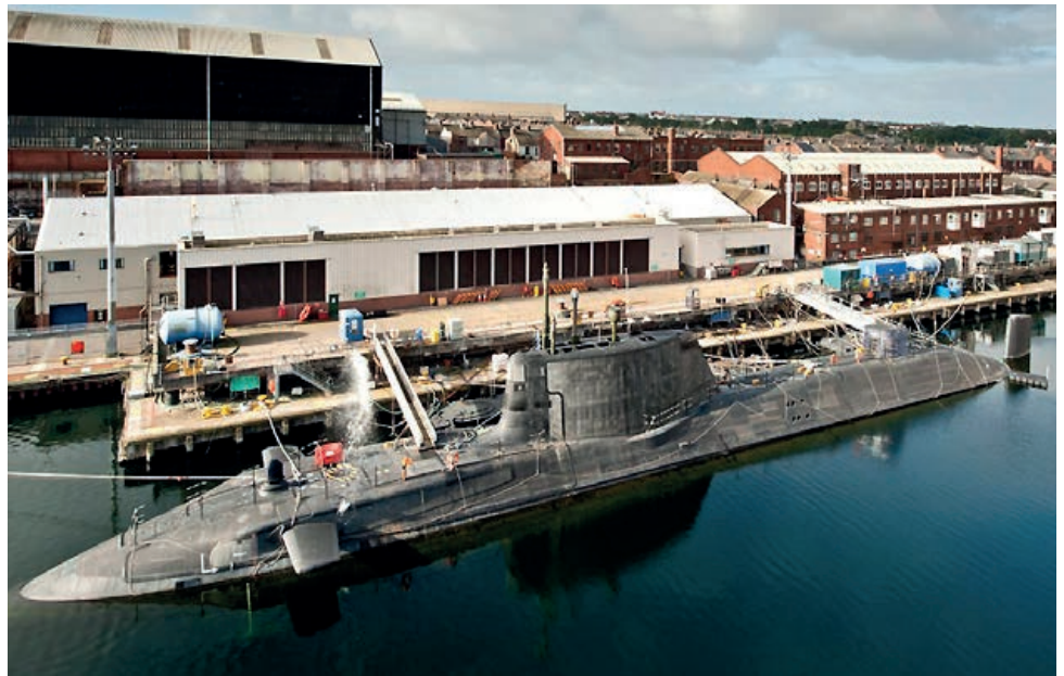
HMS Ambush preparing to leave builder's yard at Rosyth, Scotland