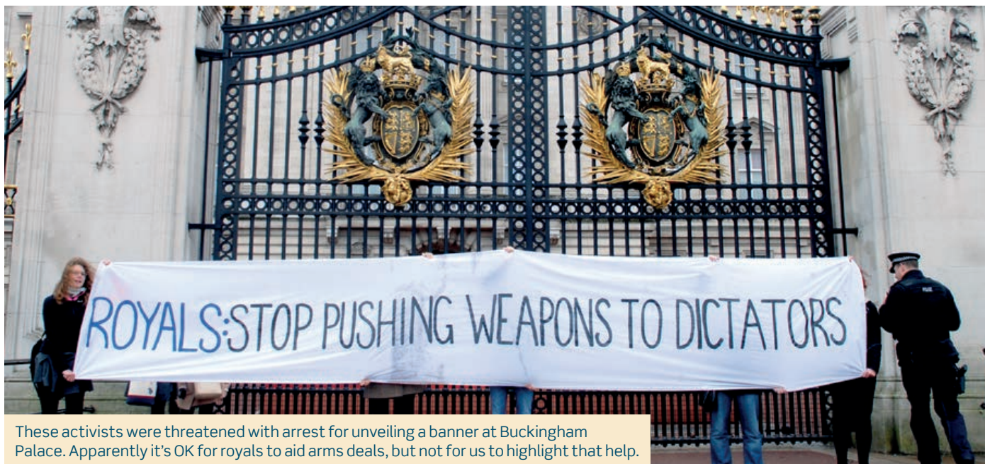
These activists were threatened with arrest for unveiling a banner at Buckingham Palace. Apparently it's OK for royals to aid arms deals, but not for us to highlight that help.

Sarah Waldron considers the latest instalment in a shameful record of royal support for arms deals.