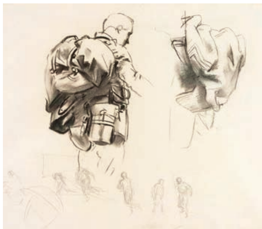
A pencil sketch with football, by John Singer Sargent