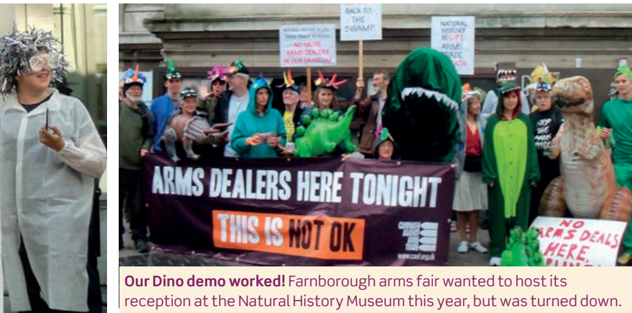
Our Dino demo worked! Farnborough arms fair wanted to host its reception at the Natural History Museum this year, but was turned down.