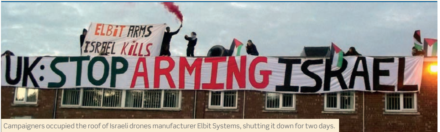
Campaigners occupied the roof of Israeli drones manufacturer Elbit Systems, shutting it down for two days.

The UK's arms export policy rarely comes under as much scrutiny as it did in the summer. As Israel launched its devastating attacks on Gaza, leaving more than 2,000 dead, over 500 of them children, challenges came from all sides. Thousands of people lobbied MPs, emailed ministers and took to the streets to call on the UK government to stop arming Israel. The fallout even saw Baroness Sayeeda Warsi, a Conservative peer and Foreign Office minister, resigning from the Government in opposition to its uncritical support for the bombardment of Gaza.