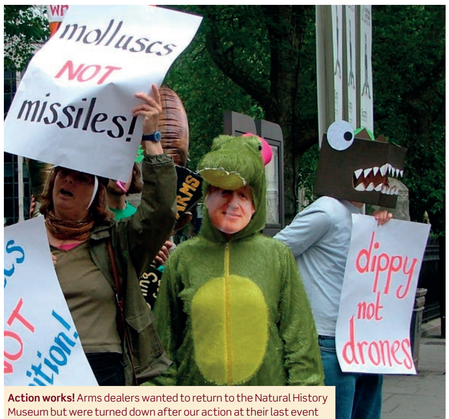
Action works! Arms dealers wanted to return to the Natural History Museum but were turned down after our action at their last event