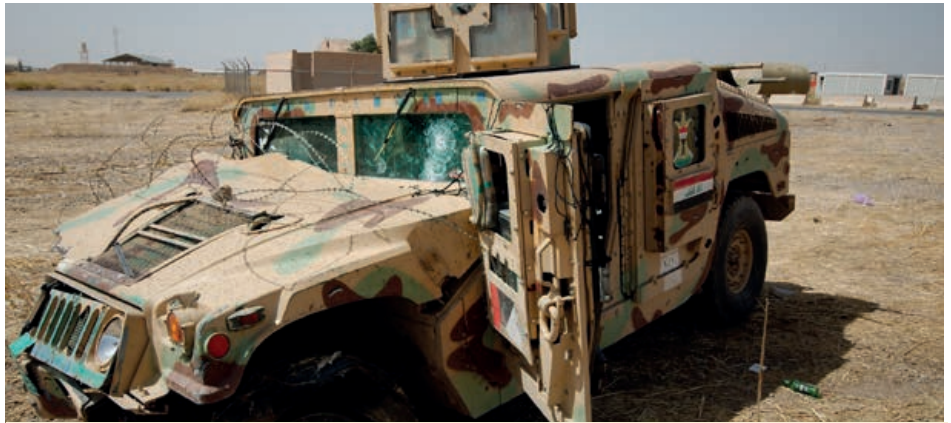
A US-made Humvee abandoned by the Iraqi Army at Kirkuk airport.

One of the reasons IS is so well armed is because it has weapons that were originally sold to the Iraqi government. Weapons have a long shelf-life and can easily change hands; after looting Iraqi army bases, IS fighters are reported to have access to US-made Humvees, M1 Abrams tanks and surface-to-air Stinger missiles. This is not a problem that is unique to Iraq. The Malaysia Airlines Flight 17 tragedy in Ukraine