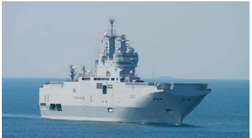
Russia has ordered two French Mistral class warships

Telegraph, 3/9/14; Financial Times, 4/9/14