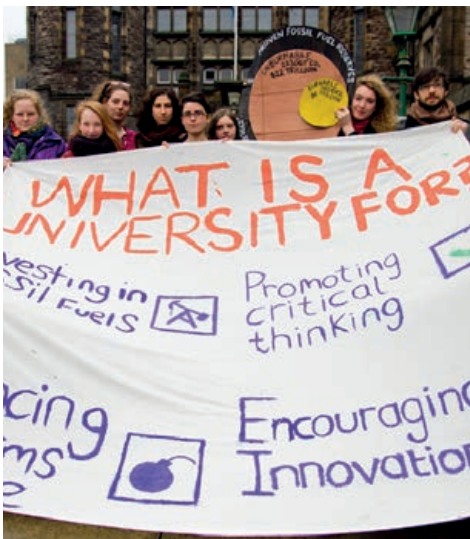
Students at Edinburgh University call for ethical investment

The arms trade quietly cuddles up to universities in three main ways, recruitment, research and investment, and the Universities Network challenges all three. We want arms companies out of our education system.