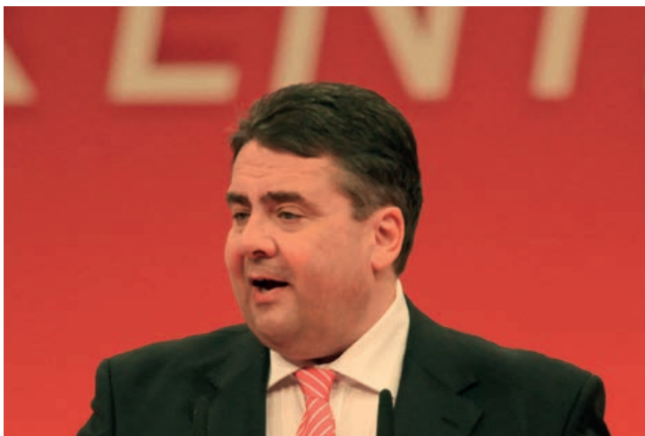
Sigmar Gabriele, Germany's economic minister