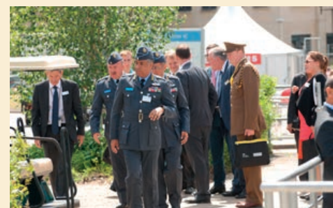
Civil servants and military personnel show a delegation from Oman into BAE's exhibition area

“legitimate” looked like. Although Farnborough is best known for its public airshow, in the days before it is home to an international arms fair, where the world's major weapons manufacturers woo military delegations from around the world. They are promoted and supported by the UK government.