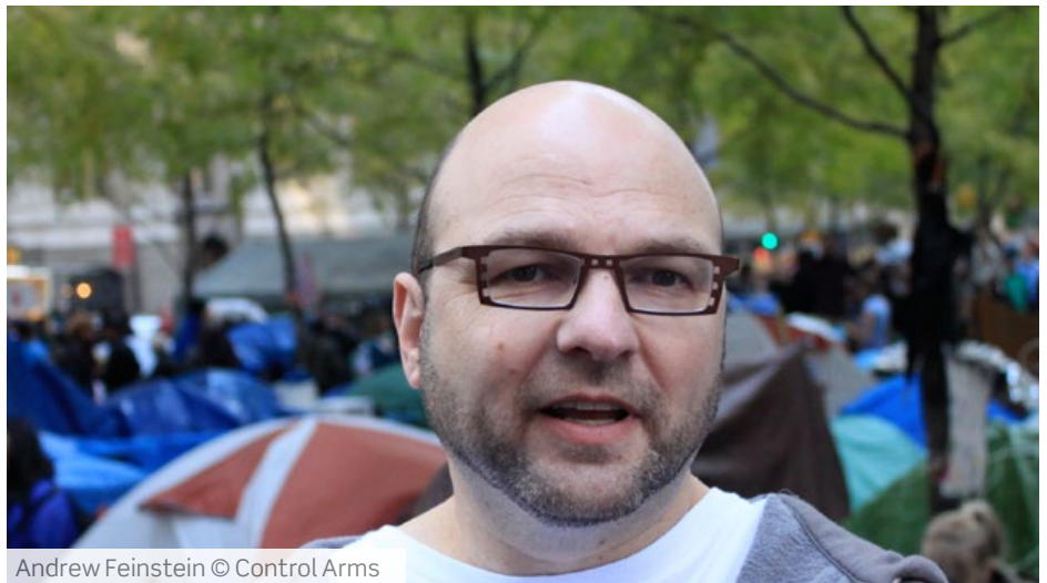
Andrew Feinstein © Control Arms

Feinstein explained the corruption of the arms trade, especially by UK companies like BAE Systems