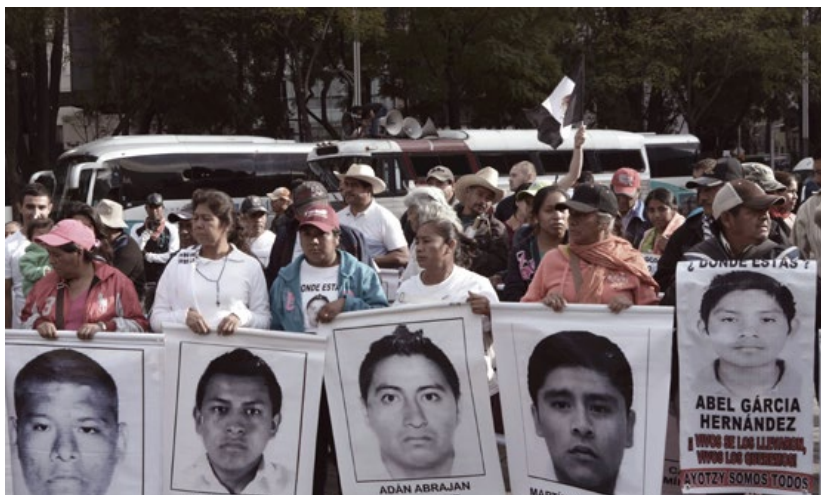
A protest in Gerrero, Mexico, where students were killed by police. Germany faces scrutiny for the sale of Heckler & Koch rifles that may have been used in the region