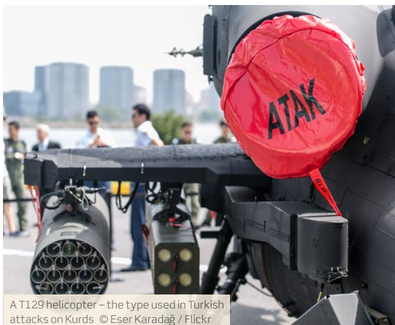
A T129 helicopter – the type used in Turkish attacks on Kurds