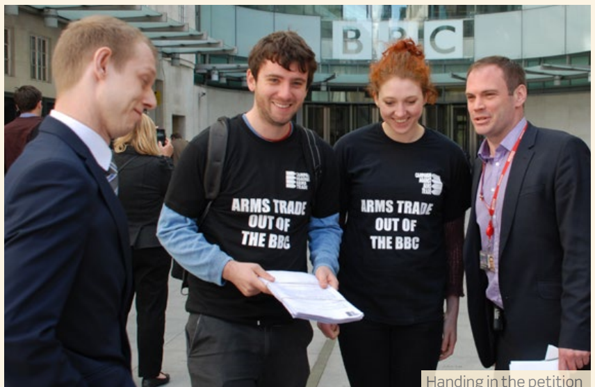
Handing in the petition