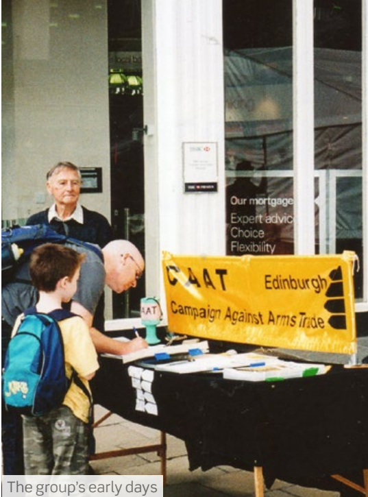
The group's early days