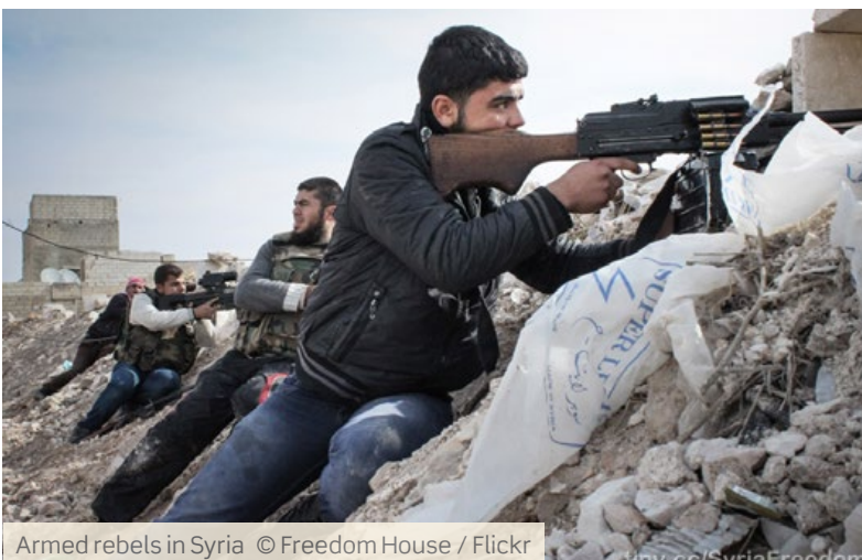
Armed rebels in Syria