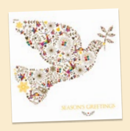
Pack of 10 Colourful Dove cards (size 125 x 125mm)