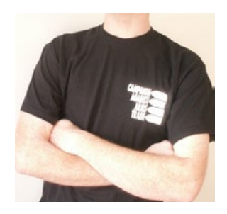
Black unisex t-shirt (available in S, M, L & XL)