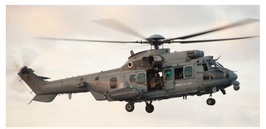
An Airbus Caracal military transport helicopter

In Italy's largest ever naval export deal, Qatar has signed a contract worth €3.8bn to buy naval vessels from Italy's Fincantieri shipyard. Qatar also signed a deal worth more than €1bn with MBDA for missiles to equip the vessels.