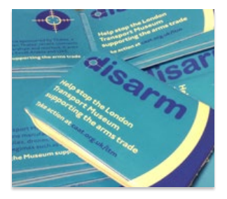
Disarm travel wallet