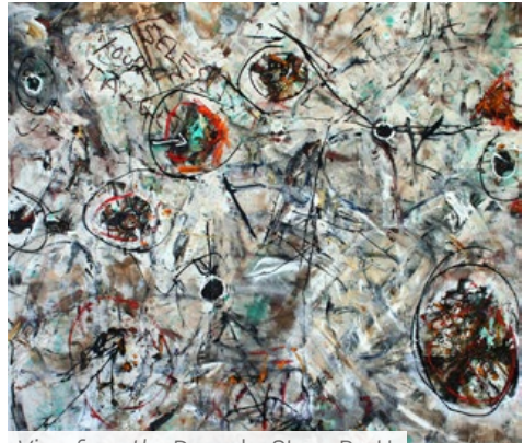
View from the Drone