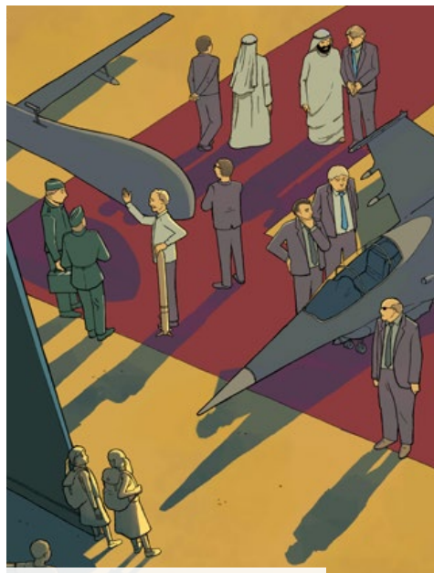
Arms Fair Poster by Rowan Abbott