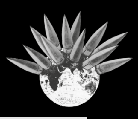
Warhead 3 by Peter Kennard

CAAT would like to thank all the artists and organisers who were involved with the Art The Arms Fair project for their work in making the arms fair visible and for the funds raised for CAAT. Take a virtual tour round the Art The Arms Fair gallery at bit.ly/ataf-tour.