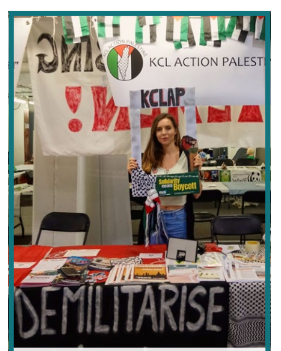
Demilitarise King's students held their Freshers Fair stall this September to bring a new generation of students to their anti-Arms Trade campaign on King's College London campus.

We support this week of action and Conference at the Gates, and call on the UK government to end its support for DSEI. As academics working on topics related to war, conflict, security, human rights, and international relations, we are opposed to the presence of this arms fair in London, and to the substantial support provided by the UK government to make it happen. It is wrong to argue, as the government does, that the arms trade contributes to security – it fuels conflict, facilitates repression, and makes the world a more dangerous place. In a world of complex challenges militarism should be regarded as part of the problem, not the solution.