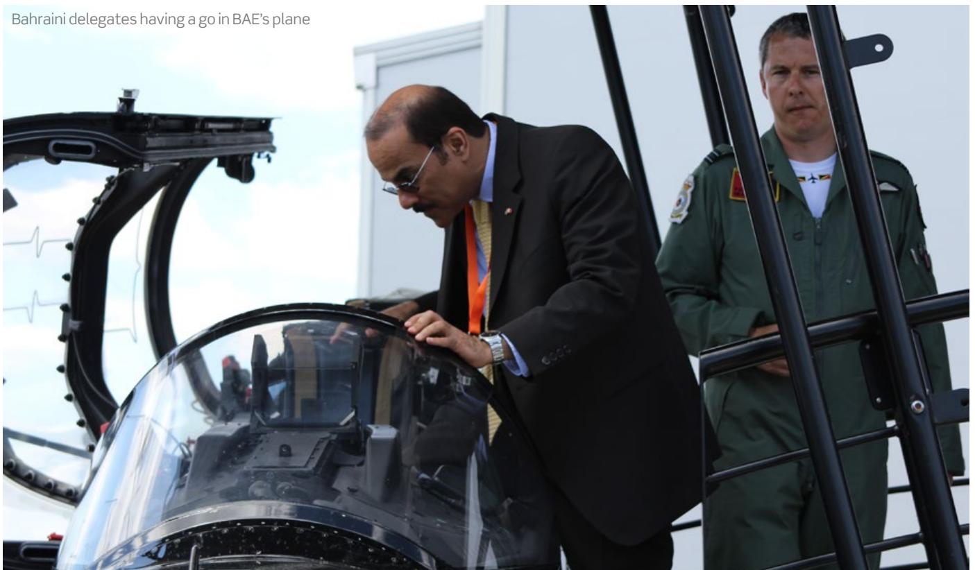
Bahraini delegates having a go in BAE's plane

Farnborough takes place every two years, and every time we expose it for what it is: an arms fair that enables weapons to be sold to human rights abusing regimes.