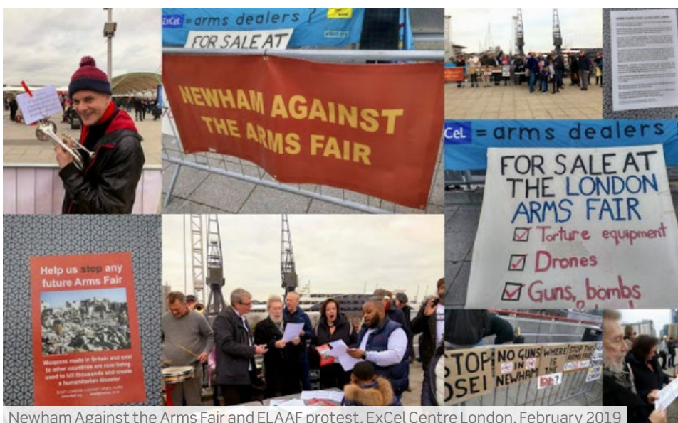
Newham Against the Arms Fair and ELAAF protest, ExCel Centre London, February 2019

Visit stopthearmsfair.org.uk to join the fight to stop DSEI.