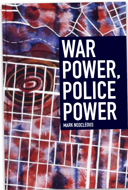
Mark Neocleous – Introduction: War Power, Police Power: one of the books we will be discussing

You can sign up for events at caat.org.uk/events .